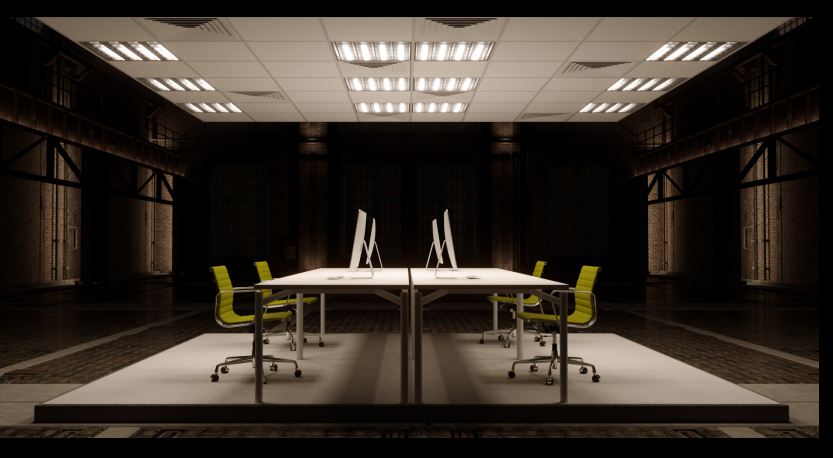
Before, with separate air ventilation and lighting

This Plenum box fits not only on the Orange Climate systems but also to any other professional Climate system in the market.