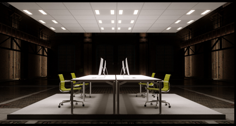
After, with Linessa Air and integrated ventilation.